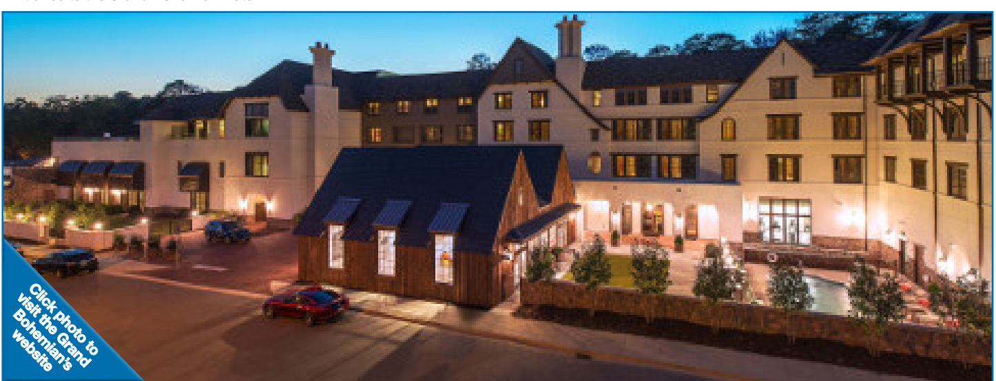
The Grand Bohemian Hotel